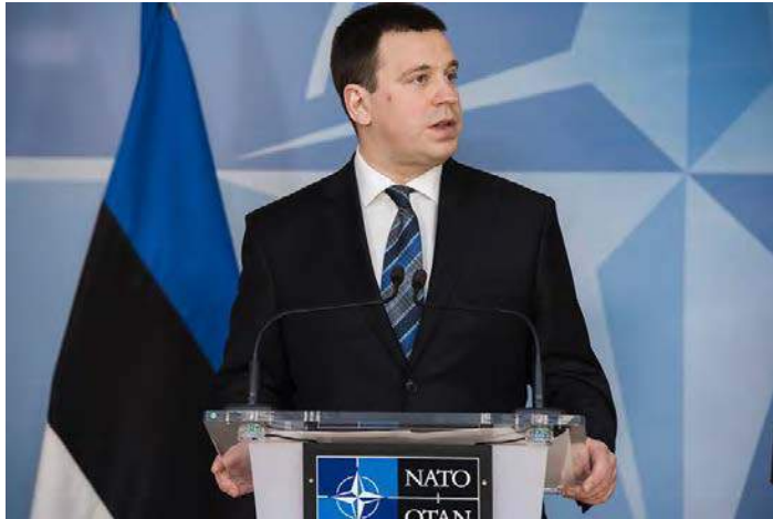
Jüri Ratas, Estonia's prime minister, gives a press conference while visiting NATO last year