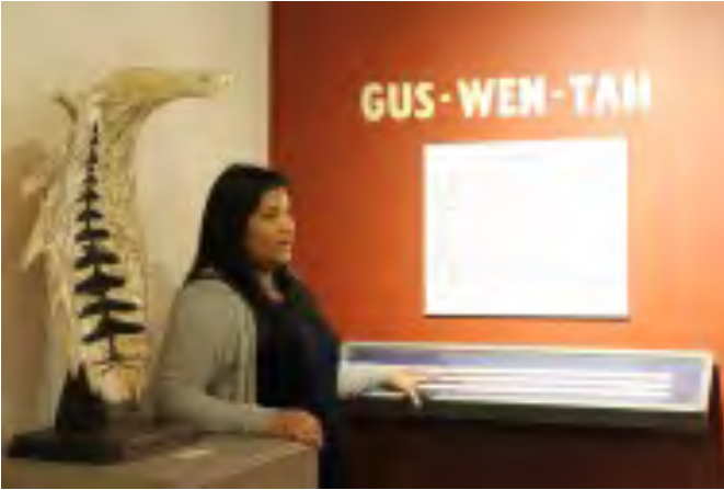
A tour guide shows the “two-row wampum,” which documents the 16 th century treaty between the British and the Five Nations Iroquois Confederacy.