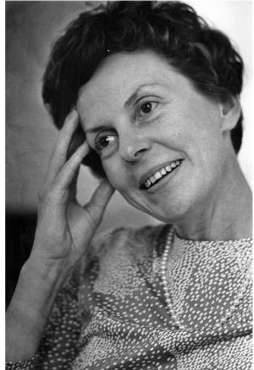
Jill Ker Conway in 1977

Conway taught American history in our Department from 1964-1975. More than that, together with Natalie Zemon Davis, she pioneered the teaching of women's history both here and across North America. She shared her path breaking syllabi in the field, wrote and edited numerous monographs and collections that provided the intellectual resources for further research and teaching, and mentored a group of graduate students who went on to become some of the field's leaders in universities around the world. Conway herself moved on to become the first woman president of Smith College (1975-85). In recognition of her many intellectual achievements and broader contributions, Barack Obama awarded her the National Humanities Medal in 2013.