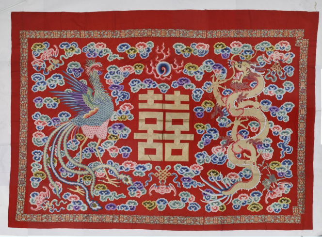
Blanket used for weddings ↑