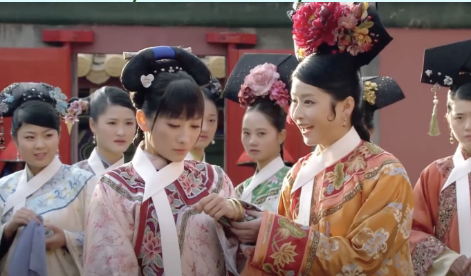
Verbal abuse ↓ (scene from one of my fav tv show)

Non-elite widows commit suicide for moral reasons: Threat of chastity and verbal abuse killed the non-elite women